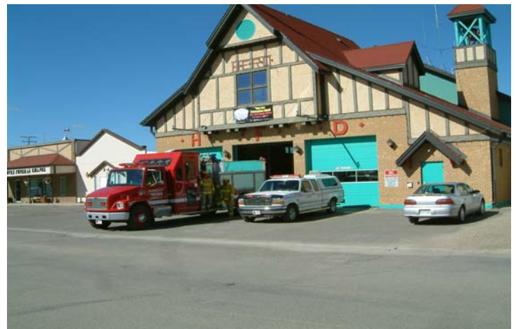
Humboldt Fire Department

The City of Humboldt's protective services include Fire Protection, Police and Ambulance services. The Fire Department are highly skilled paid on call firefighters. Policing for the City is provided under contract by the Royal Canadian Mounted Police (RCMP). Ambulance service is provided by the Humboldt Ambulance and District service. They all participate in the Emergency Response 911 system.