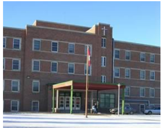
St. Elizabeth's Hospital

Saskatoon Health Region Box 1930 Humboldt, SK S0K 2A0 Phone: 306-682-5526 Fax: 306-682-3596 www.saskatoonhealthregion.ca