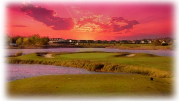
18 hole golf course with a true Saskatchewan sunset