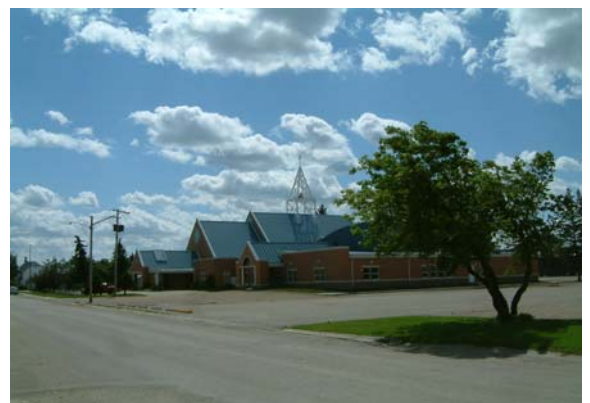
St. Augustine Catholic Church