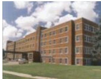
St. Elizabeth's Hospital of Humboldt, built in 1955.

tradition as St. Elizabeth's moves toward a future with expanded ambulatory care, emergency and diagnostic space. The new facility will house 34 acute in-patient beds (32 medical/surgical beds and two