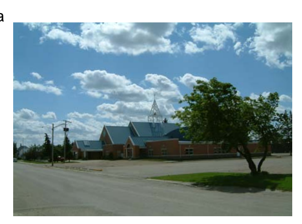
St. Augustine Catholic Church