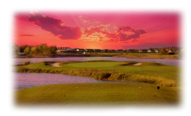
18 hole golf course with a true Saskatchewan sunset