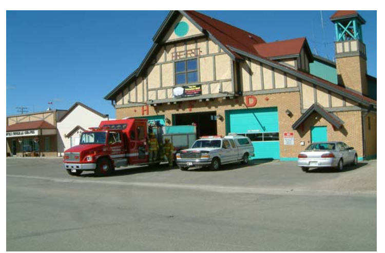
Humboldt Fire Department

The City of Humboldt's protective services include Fire Protection, Police and Ambulance services. The Fire Department are highly skilled paid on call firefighters. Policing for the City is provided under contract by the Royal Canadian Mounted Police (RCMP). Ambulance service is provided by the Humboldt Ambulance and District service. They all participate in the Emergency Response 911 system.